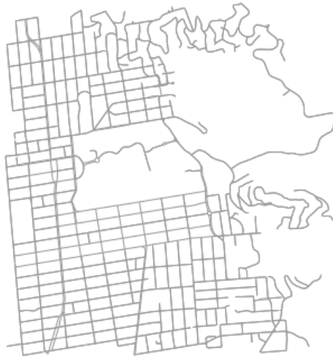
Figure 5: Output from codebox 16

Note that the preceding code snippet modeled subway rail infrastructure which thus includes crossovers, sidings, spurs, yards, and the like. For a station-based train network model, the analyst would be best-served downloading and modeling a station adjacency matrix.