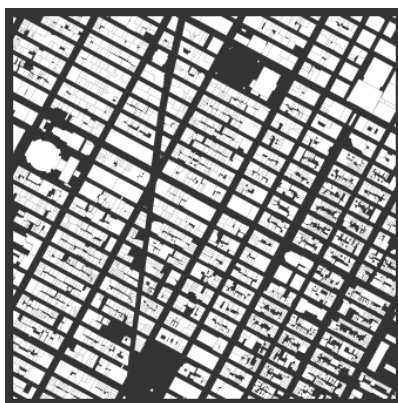
Figure 7: Output from codebox 19