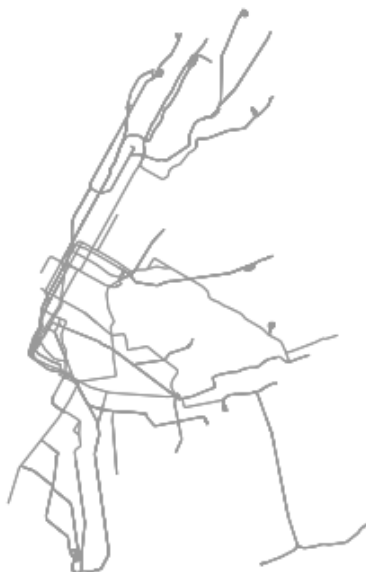
Figure 6: Output from codebox 18