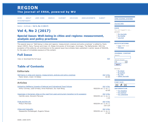
(a) Special Issue