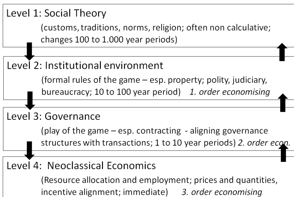
Figure 2: Where does the action reside?*

*WILLIAMSON, O. E. (1996:3f) asks this question; the arrows, supposed to indicate debatable directions of embeddedness of the levels.