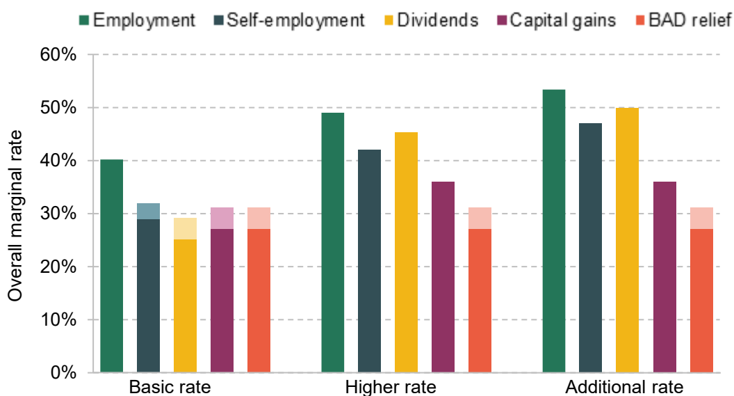
Figure 5.2. Illustration: rates increases to go alongside greater loss offsets

Note: Tax rates on employment and self-employment are inclusive of all NICs; tax rates on dividends and capital gains are inclusive of corporation tax. Lighter coloured segments of the bars show the proposed reform; the darker segments are the same as in Figure 2.1.