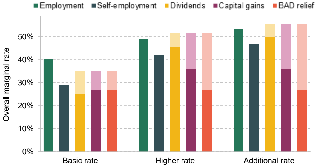
Figure 5.1. Illustration: taxing dividends and capital gains at income tax rates

Note: Tax rates on employment and self-employment are inclusive of all NICs; tax rates on dividends and capital gains are inclusive of corporation tax. Lighter coloured segments of the bars show the proposed reform; the darker segments are the same as in Figure 2.1.