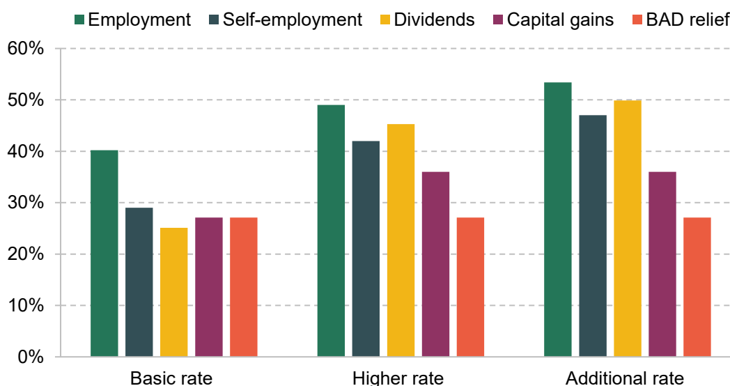
Figure 2.1. Overall marginal tax rates, by income type, 2020–21

Note: Tax rates on employment and self-employment are inclusive of all NICs; tax rates on dividends and capital gains are inclusive of corporation tax. Excludes trading allowance and employment allowance where applicable. BAD stands for business asset disposal.