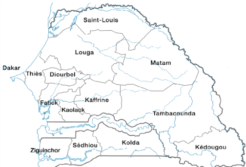
Table 1. Mapping between administrative and SAM regions

We begin our analysis by investigating pre-existing vulnerabilities of the Senegalese economy to GCC. As our primary data input, we use the Social Accounting Matrix (SAM) 2 constructed by Randriamamonjy and Thurlow (2019). The SAM represents the state of the Senegalese economy in 2015, and, unlike standard national SAMs, it represents activities, households, and factors on the regional level (Table 1). Thus, our SAM allows us to account for each region's economic and social specifics and conduct our analysis on both regional and national levels.