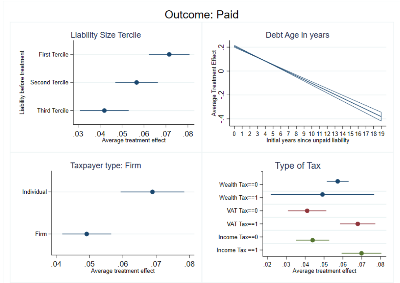
Figure 1: Heterogeneous Effect of Phone Call Intervention

Notes: N= 34,783. Each figure shows the coefficients corresponding to an OLS regression using random assignment to phone calls interacted with all covariates in Table 2: Initial Liabilities (in logs), Taxpayer type (Firm), Debt size, Debt Age, Number of Debts, Type of tax dummies. All regressions include stratification controls and district controls. 95% confidence intervals.