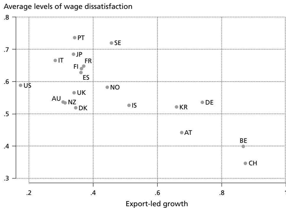
Figure 1 Export-led growth and country-average levels of wage dissatisfaction