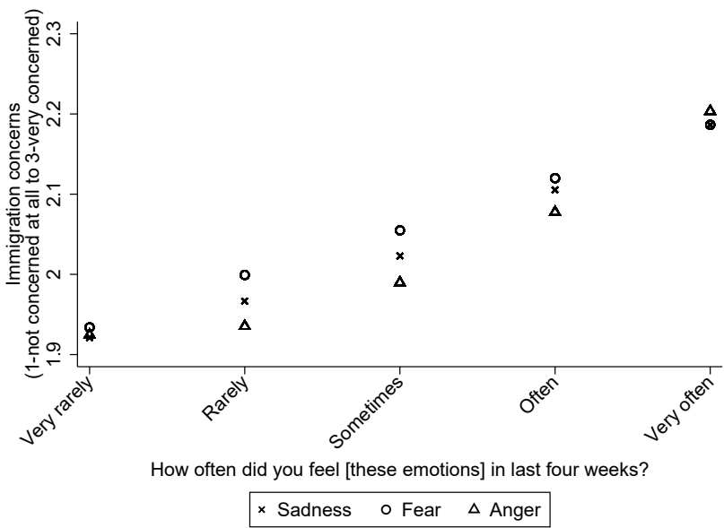
(a) Sadness, fear, and anger