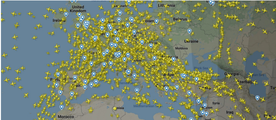
Figure 1: Planes over Europe, 2 nd October, 2018 at 5:30 pm 4

Anyone who at any given point in time looks at the planes simultaneously in the air over Europe (Figure 1), wonders involuntarily whether this picture represents an efficient and optimal system. It seems obvious that improvements would be conceivable.