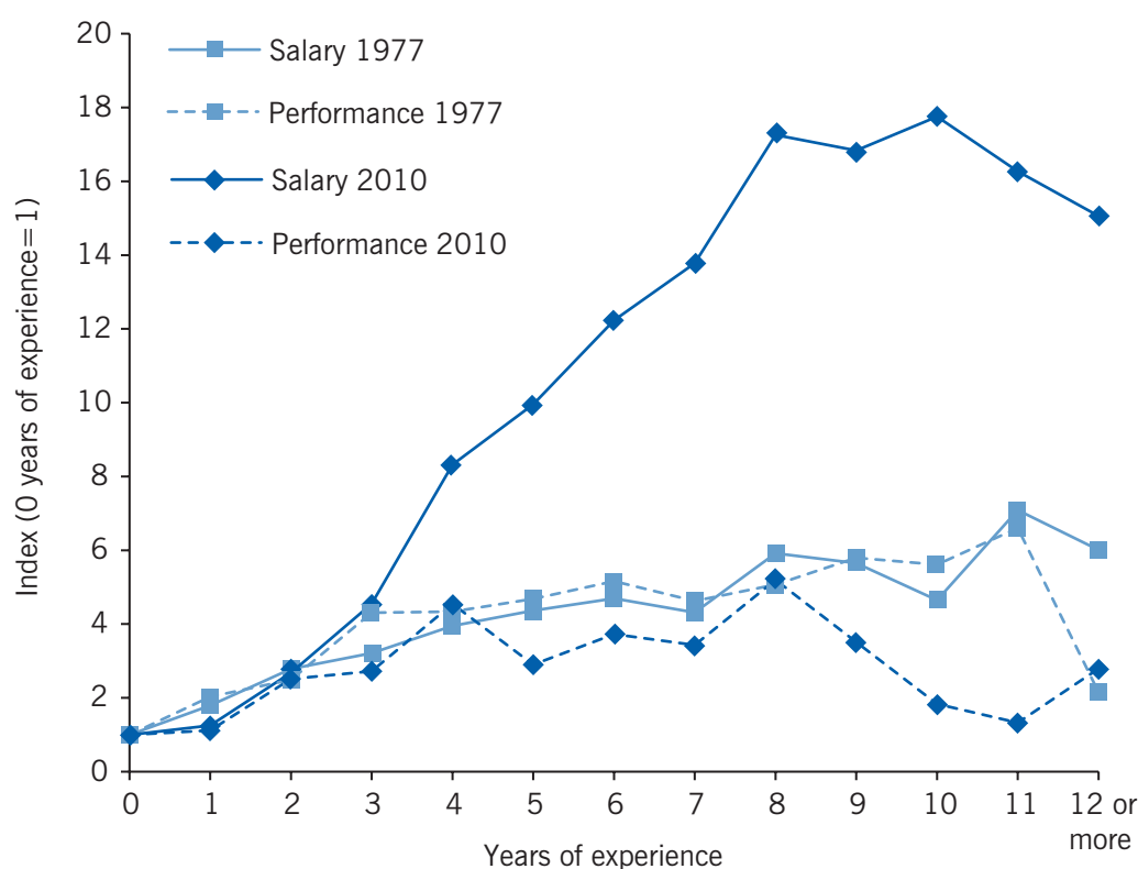
Figure 2. Salary–experience and performance–experience profiles in Major League Baseball in 1977 and 2010

Note: All series are normalized so that the value for zero years of experience is equal to one.