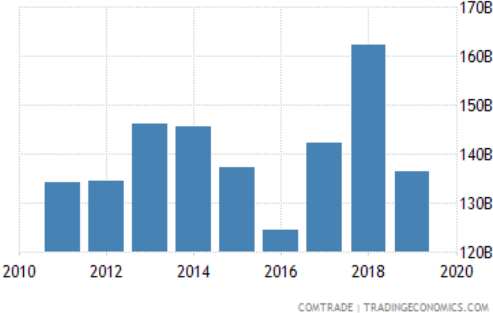
Source: Trading Economics n.d.