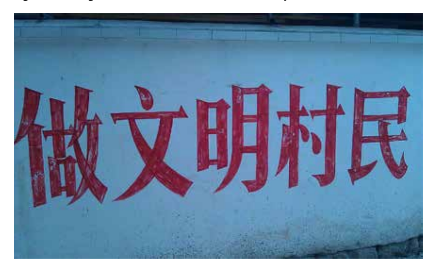
Figure 5.3 Slogan for the creation of a civilised countryside