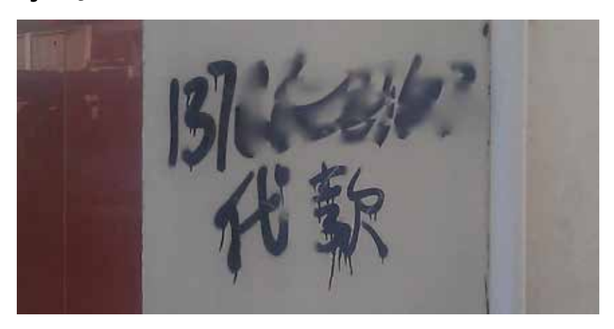
Figure 6.3 An advertisement for informal credit