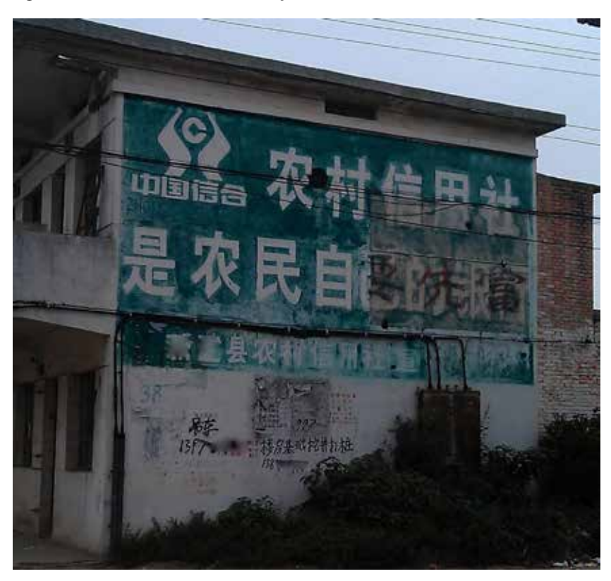
Figure 6.1 Graffiti on rural credit cooperative advertisement

the 12 members of the FC to invest in highly profitable and risk-reducing vegetable greenhouses. In this case microcredit represented more than just financial capital – it represented inclusion into the developed vanguard at the local level, and many of the villagers took the exclusion personally. For instance, the head of one household described the FC by saying: