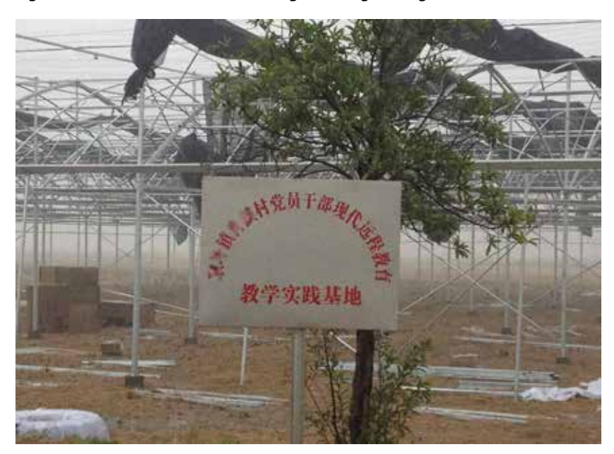
Figure 5.4 Rural modernisation through new vegetable greenhouses

that this type of locally-led technology diffusion network might become a pilot programme that is encouraged and supported by local governments in other areas. It thus has the potential to facilitate wider 'sustainable' de-marginalisation through the transfer of agricultural technologies to the surrounding townships and counties (Wu & Zhang, 2013).