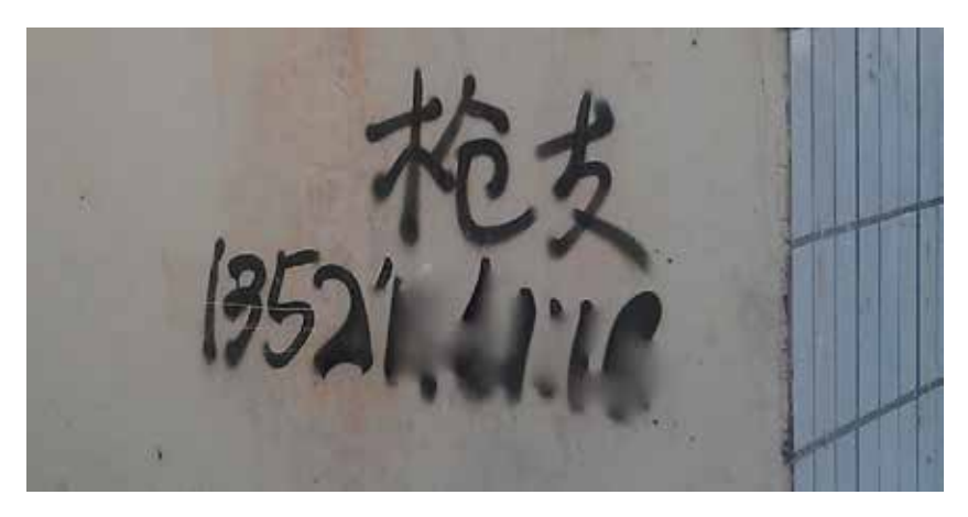
Figure 6.4 An advertisement for guns

to gain access to the entire quota of 22 loans by falsifying the documents of non-borrowing households and claiming them as fake FC members. This was done with the blessing of the township and county branches of the MoHRSS. The households that were instrumentally used in this way were relatively marginal and powerless, and had no knowledge that their identification documents had been used to apply for loans. In one case, the FC used the information of a low-level administrative worker in the village government. This abuse of power was not difficult, as she was already in a subordinate position in relation to the head of the FC, who was also the village secretary, and her identification documentation was easily available