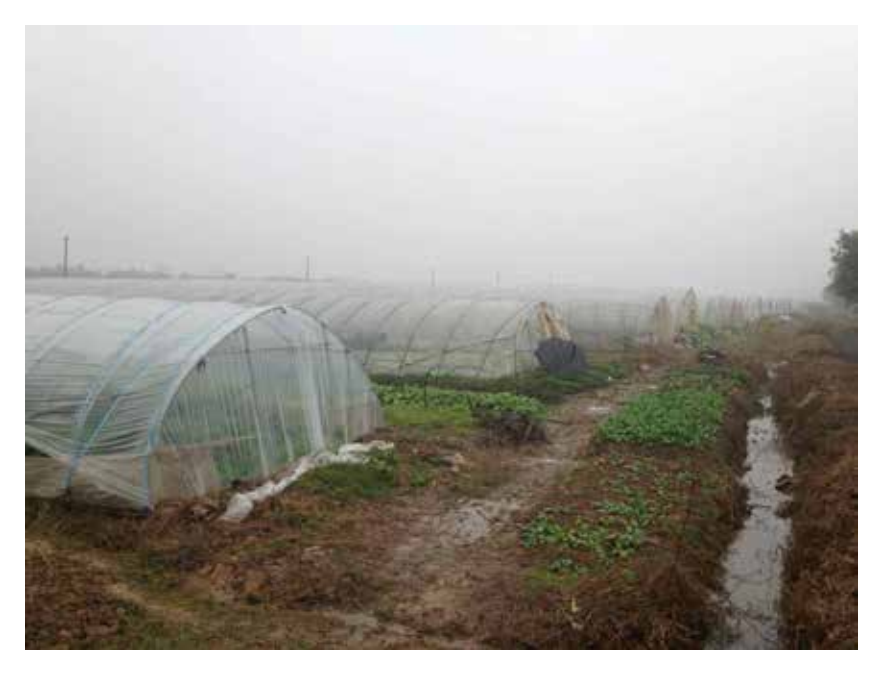
Figure 3.1 Small vegetable greenhouses in the AT