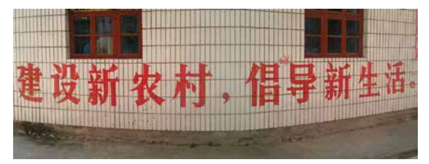
Figure 5.2 Slogan for the construction of a new socialist countryside