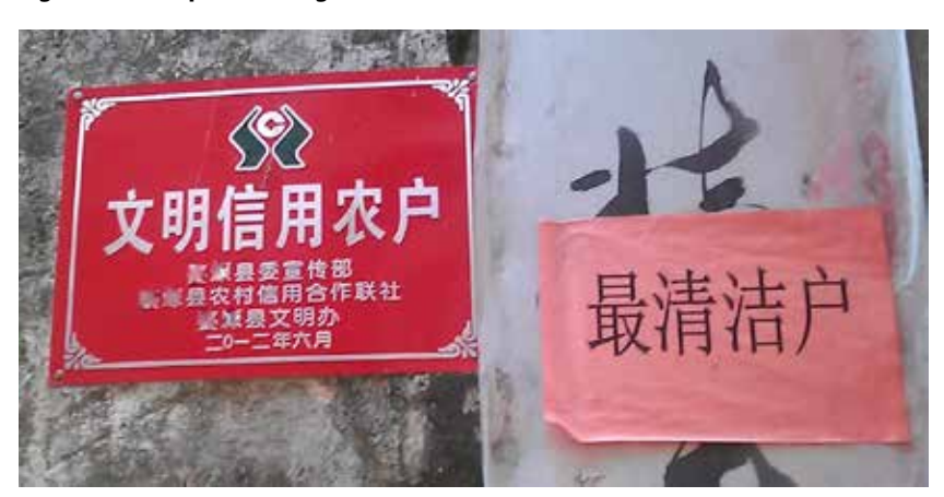
Figure 1.1 Plaque denoting a 'civilised borrower' household