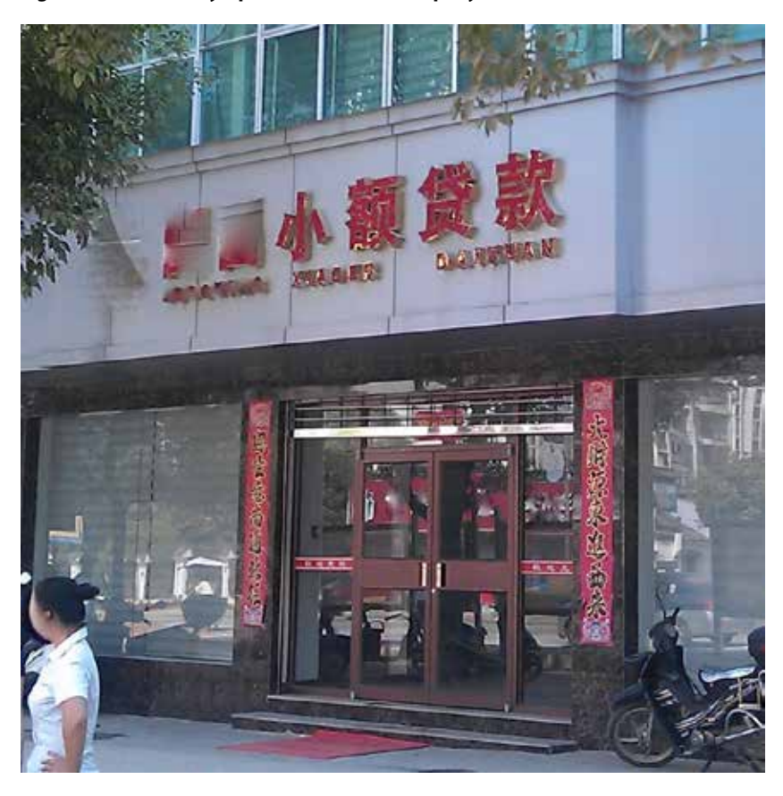
Figure 6.2 A recently-opened microloan company