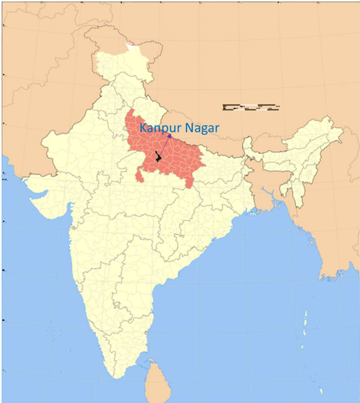
Map A: Location of Kanpur Nagar, Uttar Pradesh on the Map of India