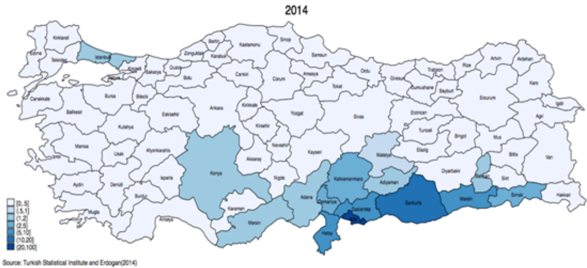
Figure 2: Ratio of Migrants to Natives across Provinces (multiplied by 100), 2014–2015