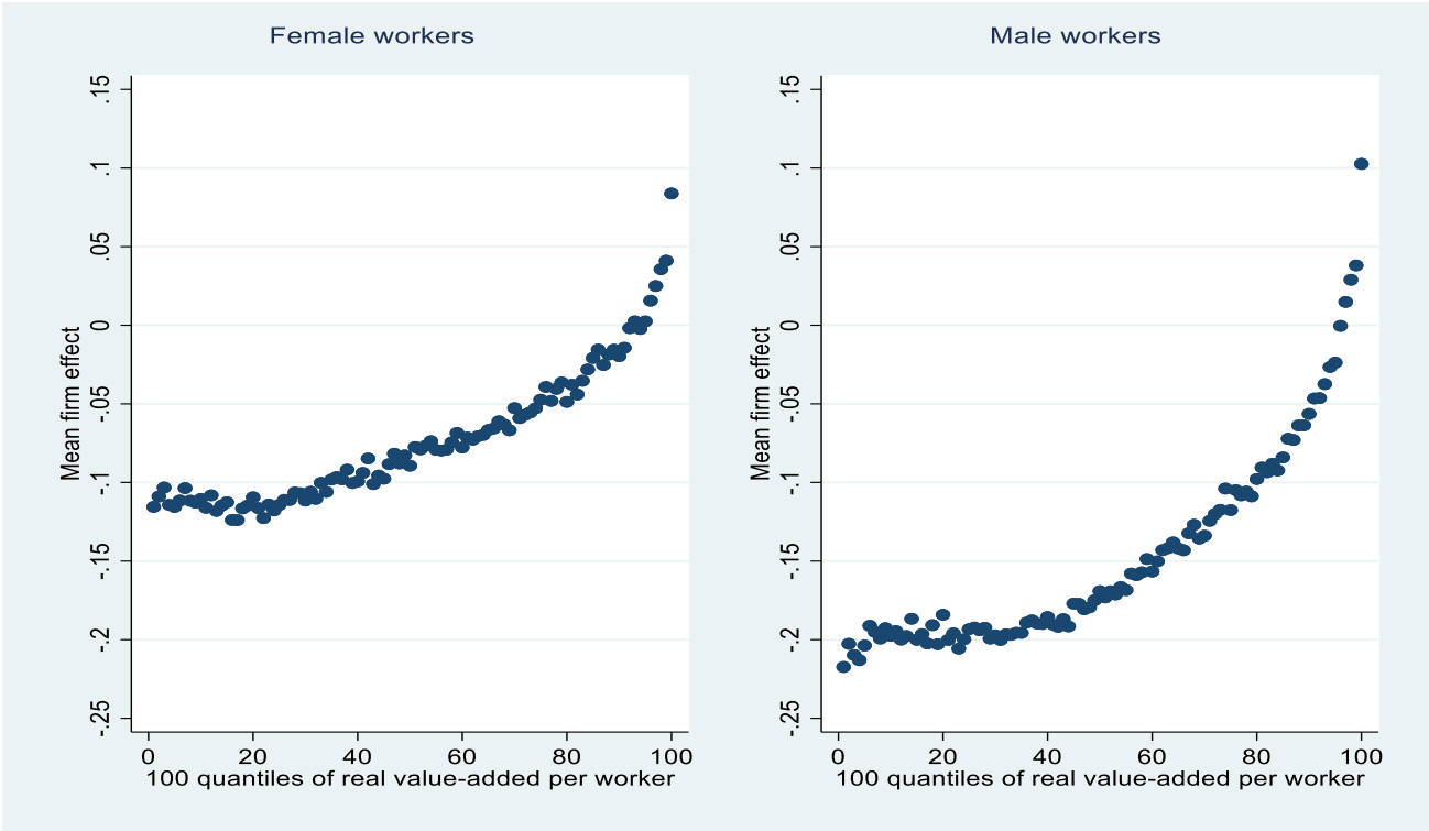
Figure 2: Firm effects and labour productivity, 2001-2015

Note: The figure plots the firm effect and logarithmic firm labour productivity (real value added per worker) in 100 quantiles from Table Source: Authors' tabulation of the Canadian Employer-Employee Dynamics Database, 2001-2015.