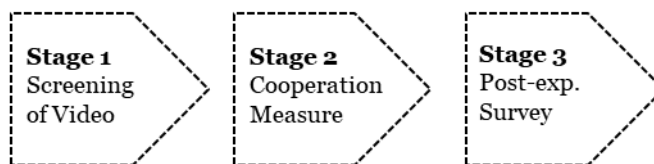
Figure 3: Experimental Design

The stages of our intervention can be found in Figure 3. Our experiment uses two treatment conditions and one control group. In Stage 1 participants in the treatment group watched one of two videos showing examples of communities that were successful at self-organizing in the Democratic Republic of the Congo. In Stage 2 , they decided how much they wanted to contribute to a real public good: a savings group. Participants in the control group did not watch any video and started directly in Stage 2 . A sample of participants completed a survey where we measured aspirations and obtained information on socioeconomic characteristics ( Stage 3 ). After completion of the survey, we paid the participants the survey fee and screened another video that explains how savings groups work. We describe the content of the treatment videos and design of the field experiment in more detail in the following.