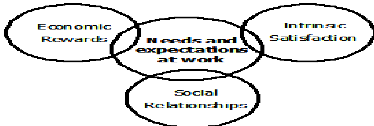
Figure 2: Needs and expectations of people at work (Adopted from Gunn, 2008)

Every individual works in an organization for a purpose and that purpose is based on a number of needs and wants she/he wants to achieve. These needs might be driven by security, power, a sense of prestige, satisfaction, money, and achievements ( Herzberg, 1966); (Maslow, 1954): (Alderfer, 1969).