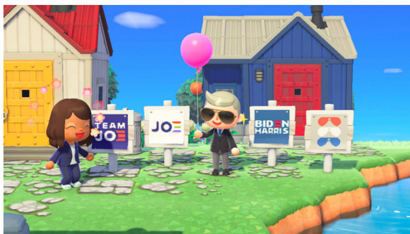
Figure 2: Joe Biden's ACNH campaign