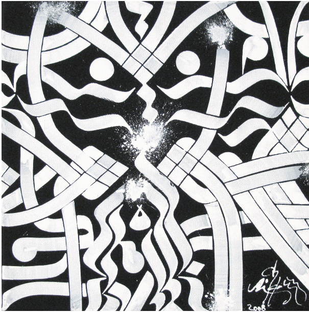
Rostarr, Negative Space Traveler 7 (2008). Copyright Rostarr; used with permission.

Consider Negative Space Traveler 7 (2008), a painting by New York-based painter Rostarr. In interpreting this painting, we create order in the network of lines by deciding on a series of relationships that generates figures; these decisions structure what we see, and are part of the work's significance. The appearance of the figures in these paintings requires an interpretation of abstract lines as representation; it mirrors the choices made in interpreting the Necker Cube.