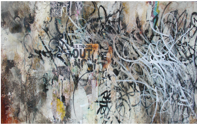
Jose Parlá, Temporary Autonomous Zone (2008). Copyright Jose Parlá; used with permission.

“US TROOPS OUT NOW,” torn and ragged, an official statement that dominates the painting. The decay of the poster implies the instability of the political message it conveys; as much as the collage employed is itself always already an example of semiotic disobedience, this political statement both covering earlier and covered by later layers invokes a superposition of meaning. While explicitly a political statement, at the same time it lacks the urgency appropriate to the message conveyed—NOW appears to be long past—thus, attenuated. Its specific political message becomes something historical; life moves inexorably on, incorporating both the dominant powers and objections of the dominated into its matrix: visualizing the equivalence of positions identified by the state of information.