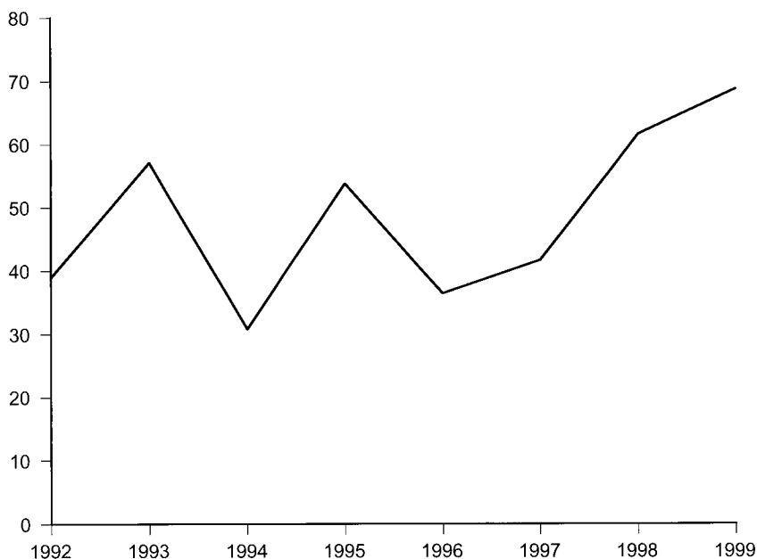
Figure 2: US Share in Total Extra-EU-15 FDI Outward Flows, 1992–1999 (in per cent)