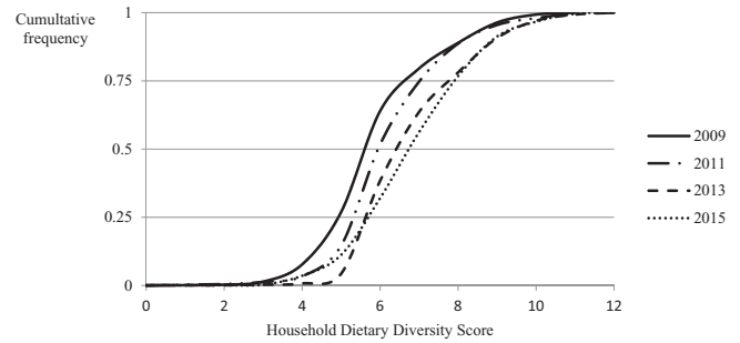
FIGURE 3 Cumulative distribution of the household dietary diversity score in Marsabit, Kenya

To test Hypotheses 3 and 4, we analyze whether mobile phones influence the primary household food sources. As explained above, we decompose HDDS12 into two components, namely the number of consumed food groups from self-production and the number of food groups from purchases. To