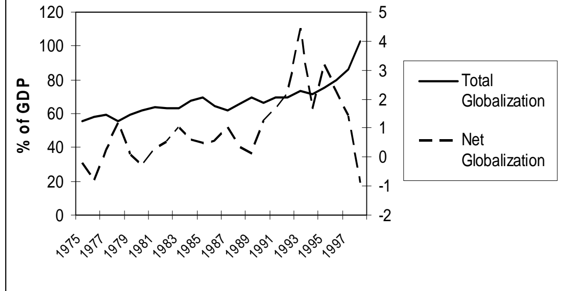
Figure 1. Economic Globalization in 17 Affluent Democracies, 1975-1998

Displaying the trends in our two dependent variables is also instructive. Figure 2 displays the averages of our two dependent variables from 1975 to 1998. During the time globalization substantially increased, the two welfare state measures were remarkably stable. By 1975, the welfare state was institutionalized as the average government expenditures was 41 percent of GDP and the average social security transfers was 13.7. Both government expenditures and social security transfers reached high points in 1983 (46.7 and 15.5). However, they peaked again in 1993: 47 for government expenditures and 16.7 for social security transfers. Moreover, both measures were actually higher in 1998 (42.4 and 14.8) than in 1975. Adding Japan (1978), Switzerland (1984) and Ireland (1991) was inconsequential to the average values. The stability in the measures problematizes the language of “crisis” in the recent literature. Given that this era combines increasing globalization with welfare state stability, the basic descriptive evidence does not clearly support claims about globalization’s positive or negative effects on the welfare state.