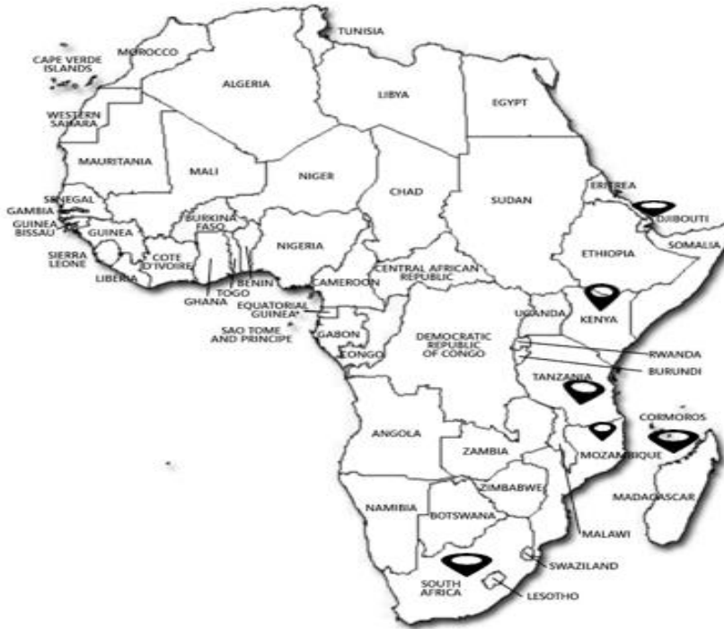
Figure 3. Selected east and southern African nations