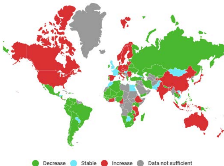
Figure 2. Map of within-country inequality change between circa 1990 and latest 2010s, Gini index

Source: changes (more than one Gini point) in income inequality estimated using a selection of series from the WIID, version 17 December 2019.