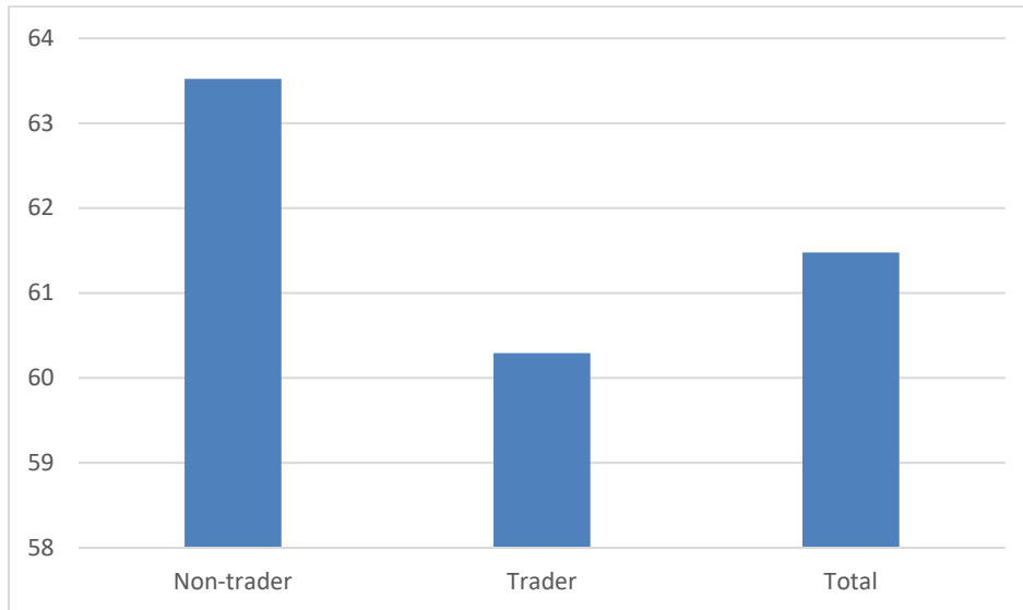
Figure 1: Female income as a percentage of male income by firm trading status