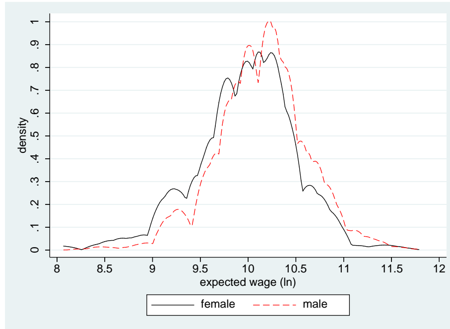
Figure 2: Expected wage by gender: non-parametric density (adaptive kernel)