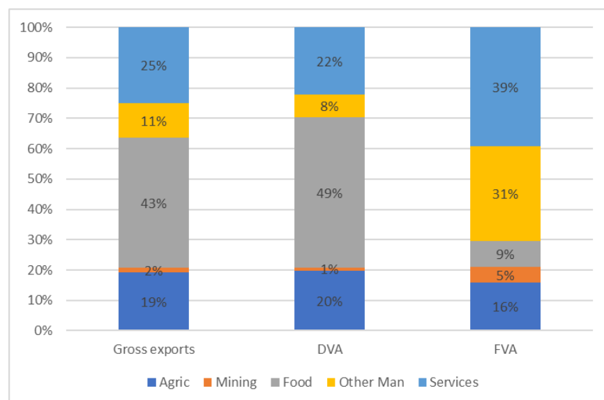
Figure 2: Industry share structure of value added in food and beverages exports

Notes: figure is based on the sum of value added by industry for the sample of countries shown in Figure 2. The share structure will therefore largely reflect that of South African exports given the dominance of the country in the region's export value.