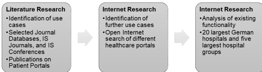
Figure 2: Research Approach

To answer our research question, we follow a three-stepped research approach. First, we review existing literature to identify publications on patient portals and corresponding use cases. Secondly, we complement the resulting list of use cases with an open web search for healthcare portals (irrespective of geography and provider). Lastly, we conduct a structured internet research on patient portals in the 20 largest German hospitals and five largest hospital groups to assess the current state of hospital patient portals in Germany (see Figure 2).