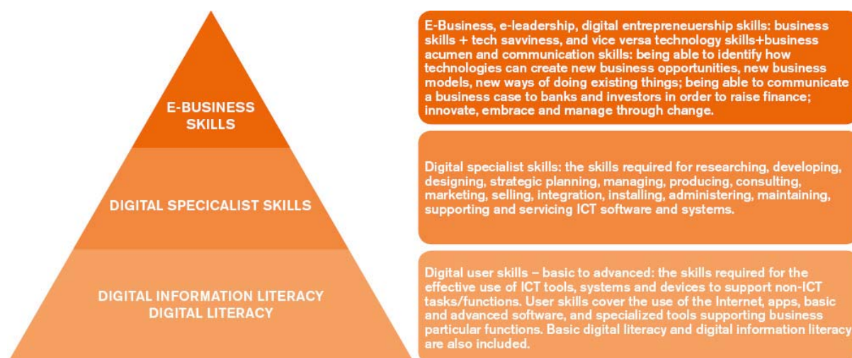
Figure 3: The digital skills pyramid

As for digital skills, UNCTAD (2017) identifies three distinct, but complementary sets of skills that are needed in advanced and developing countries alike to allow them to capitalise on digital technologies. This digital skills pyramid is set out in the figure below.