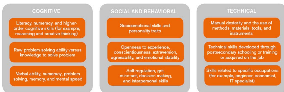
Figure 2: Skills required in a digital economy

The World Bank (2016) summarises the skills required in a digital economy in three different sets.