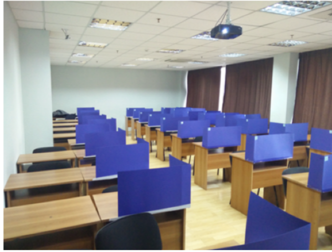
Figure 1: Experimental location

Subject pool, recruitment, and procedures. In total, 486 subjects drawn from the adult population in Tbilisi took part in the study on the informal labour market. Potential participants had to live in the capital, being able to read and speak Georgian, and being 18 years or older. Subjects in the study were recruited from two different samples of the general population in Tbilisi. The first sample comprises respondents of a previous survey who had been recruited via the random walk method in 2013. A total of 787 invitations were sent for the first wave for a total of 269 participants in the study. The second sample consists of subjects directly recruited by the Georgian team of enumerators. In this latter group we registered a lower no-response rate with 217 participants who showed up out of 409 invitations. Participants from the second wave were significantly more wealthy and less likely to be non-employed than their peers from the first wave. Other demographic characteristics were instead fairly in line across the two waves (gender, marital status, children, etc).