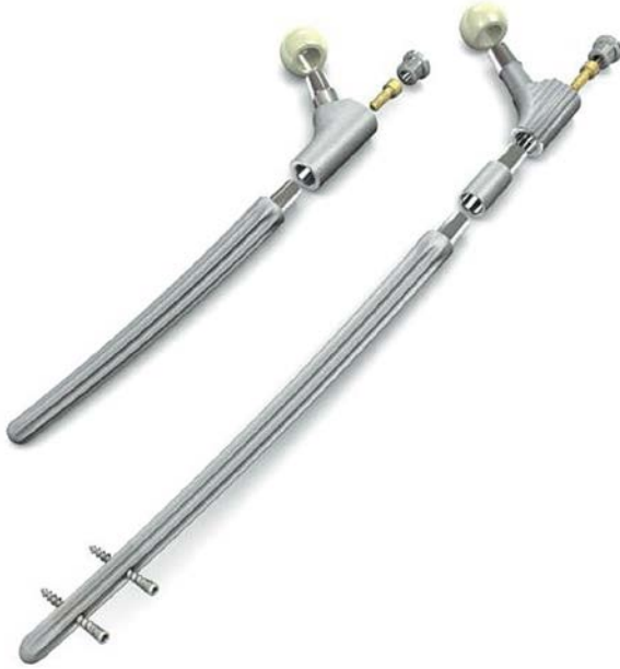
Fig. 1: The MRP-TITAN System with the lockingscrew (gold)

– An optional extension sleeve, adding 30 mm to the neck length. The continuously adjustable taper connections are locked intraoperatively with a titanium-nitride coated locking screw using an implant-specific torque wrench 25 Nm.