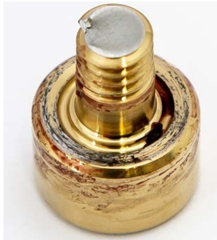
Fig.3: Torsion fracture of screw M6

Aim is to analyse the differences of fracture of the screw M6 (Fig. 3) in different settings (series 1-4). Due to the small sample numbers we selected Fisher's exact test for statistical analysis [23, 24]. Since there is the reasonable assumption that cleaning the interface reduces the probability of screw cracks, we use the one-sided variant of the test.