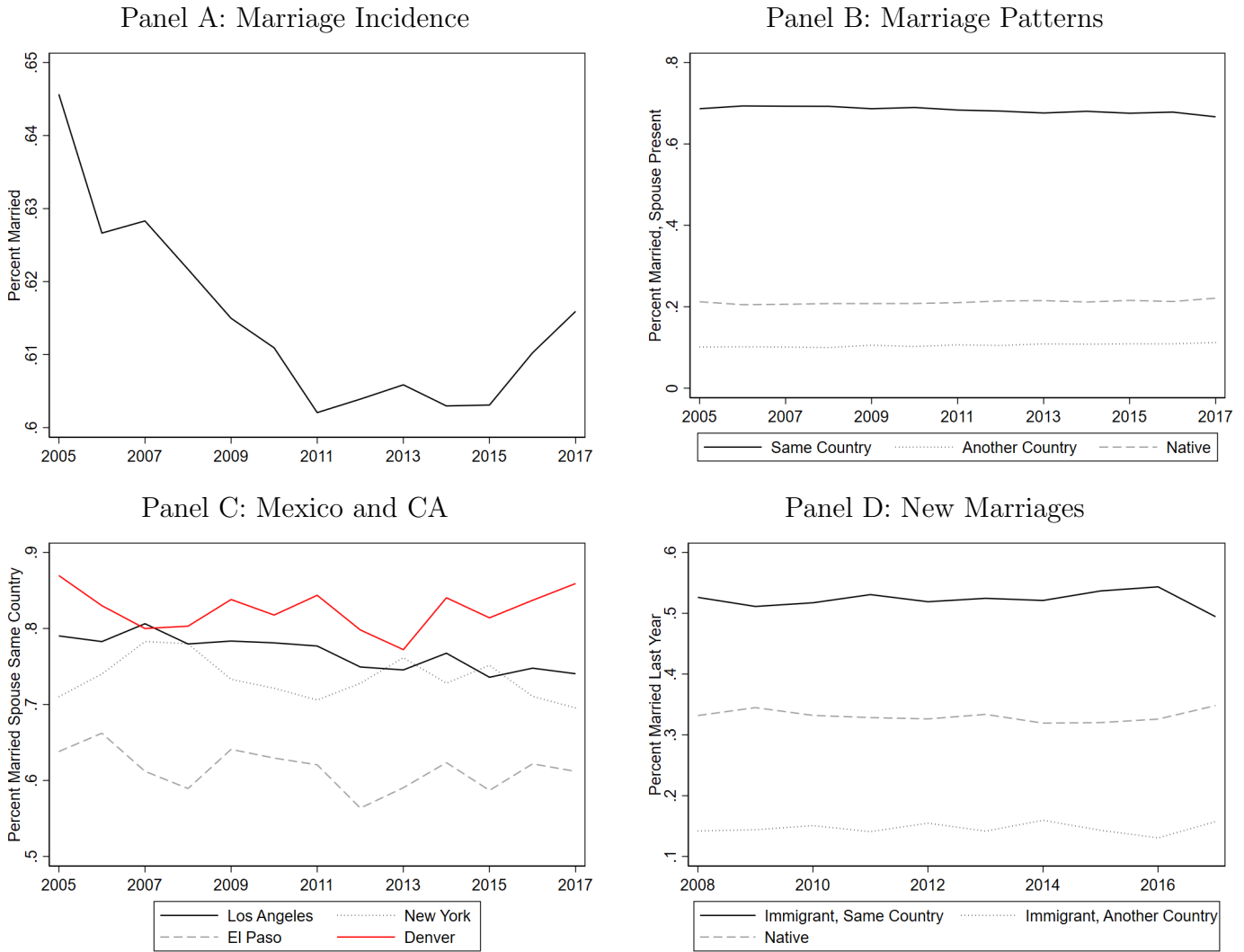
Figure 1: Trends in Marriage Incidence and Patterns

Sample limited to foreign born women (not to American citizens) ages 18-54.