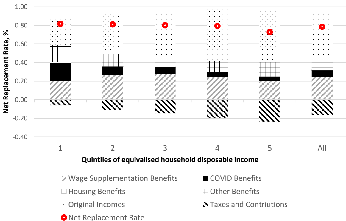
Figure 2. Decomposition (by income sources) of Net Average Replacement Income for those affected by the lockdown, by household income quintile groups

Notes: Net Replacement Rate is the ratio of household disposable income after and before the earning shock. “COVID Benefit” include newly discretionary policies such as lump sum transfers to self-employed and employees; “Housing Benefits” include the amount equivalent to the mortgage instalment for the main residence; “Other Benefits” include pension and invalidity benefits, minimum income schemes, family benefits; “Taxes and Contributions” include personal income tax, employee social insurance contributions and other direct taxes.