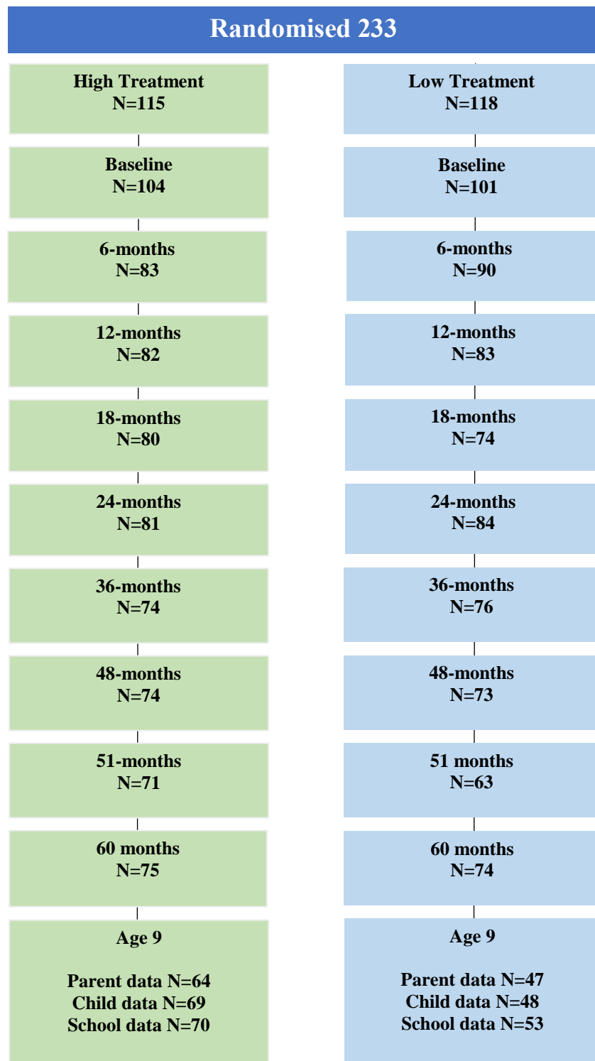
Figure 1 Participant flow