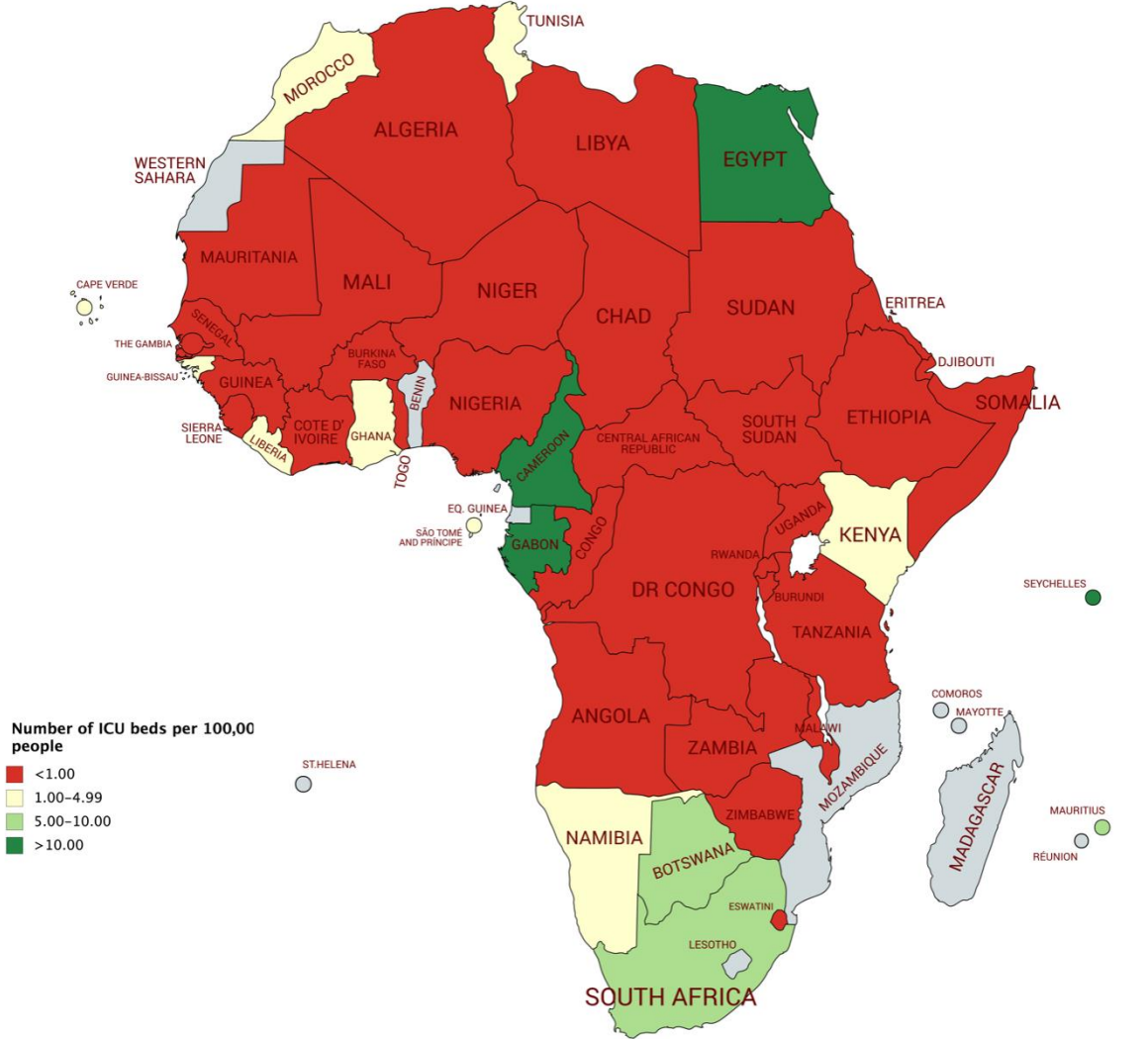
Figure 2: Number of ICU beds per 100,000 people