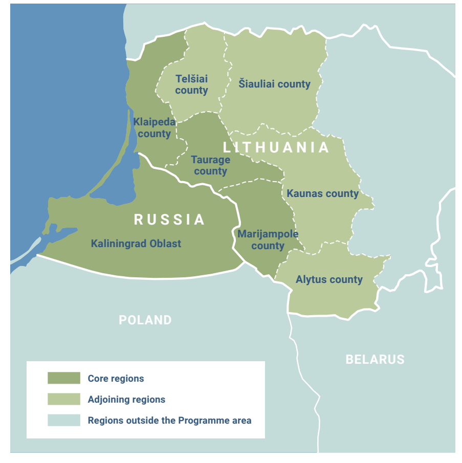
Map 5: Lithuania-Russia CBC programme area, 2014-20

The Lithuania–Russia programme 2014–20 includes Russia's Kaliningrad region and Lithuania's Klaipeda, Marijampole and Taurage counties as core regions. Alytus, Kaunas, Telsiai and Siauliai counties form Lithuania's adjoining regions (see Map 5).