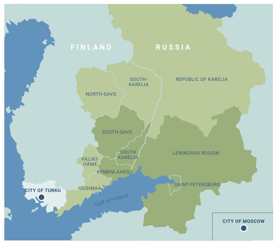
Map 2: South-East Finland-Russia CBC area, 2014-20

The South-East Finland–Russia CBC programme involves three Finnish regions (Etelä-Karjala [South Karelia], Etelä Savo [South Savo] and Kymenlaakso) and two Russian regions (Leningrad and St Petersburg) as a core area. Its adjoining region includes Uusimaa, Päijät-Häme, Pohjois-Savo, North Karelia (Finland) and Republic of Karelia (Russia) (see Map 2). The programme's overall objective will be achieved