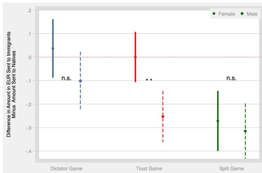
FIGURE 4 | The difference in the amount of money (in EUR) shared with immigrants compared to natives for male and female Alters in three behavioral games: the Dictator Game, the Trust Game, and the Split Game. Error bars indicate 95% confidence intervals.

we find that natives are similarly pro-social toward men and women of immigrant origin in non-strategic situations, we also observe that natives are significantly less likely to trust immigrant men in strategic encounters. Importantly, our results suggest that gendered ethnic discrimination is not simply taste-based (Becker, 1957) since in this case we should observe discrimination in the non-strategic DG and SG. Instead, gendered ethnic discrimination appears to be driven by an unwillingness among natives to trust male immigrants. However, a limitation of the current study that future research should address is to better understand how our treatment effects are moderated by personality factors, such as authoritarianism (Adorno et al., 1950) or implicit biases (Rudman and Ashmore, 2007), which may differ across individual respondents. The estimation of such heterogeneous treatment effects may shed light on the social-psychological mechanisms underlying our results.