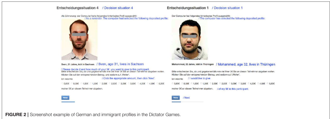
FIGURE 2 | Screenshot example of German and immigrant profiles in the Dictator Games.

as basic information such as Alter's name, age (between 29 and 34 years) and federal state of residence (see Figure 2 ). By providing pictures and using stereotypical German vs. Middle Eastern names, we could manipulate perceptions of Alter's gender and immigrant origin. Overall, we drew upon a set of profiles from eight individual Alters that were carefully selected on gender, age, ethnicity, and physical appearance. This selection was based on the results from a pre-test with a total of 37 pictures on Amazon's Mechanical Turk (MTurk) where we had the photos rated in terms of perceived expressed emotions (happy, angry, fearful, sad, neutral) and attractiveness. These are factors known to influence facial cues for trustworthiness and cooperative decisions (Todorov et al., 2015). Our final sample consisted of four ethnic Germans (two male and two female) and four individuals with migration background (again two male and two female) who were closely matched across all perceived traits 5,6 .