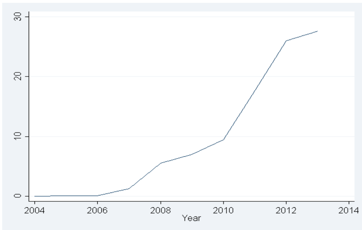
Figure B Growth Rate in the Number of MSAs Activating Interior Immigration Enforcement Measures