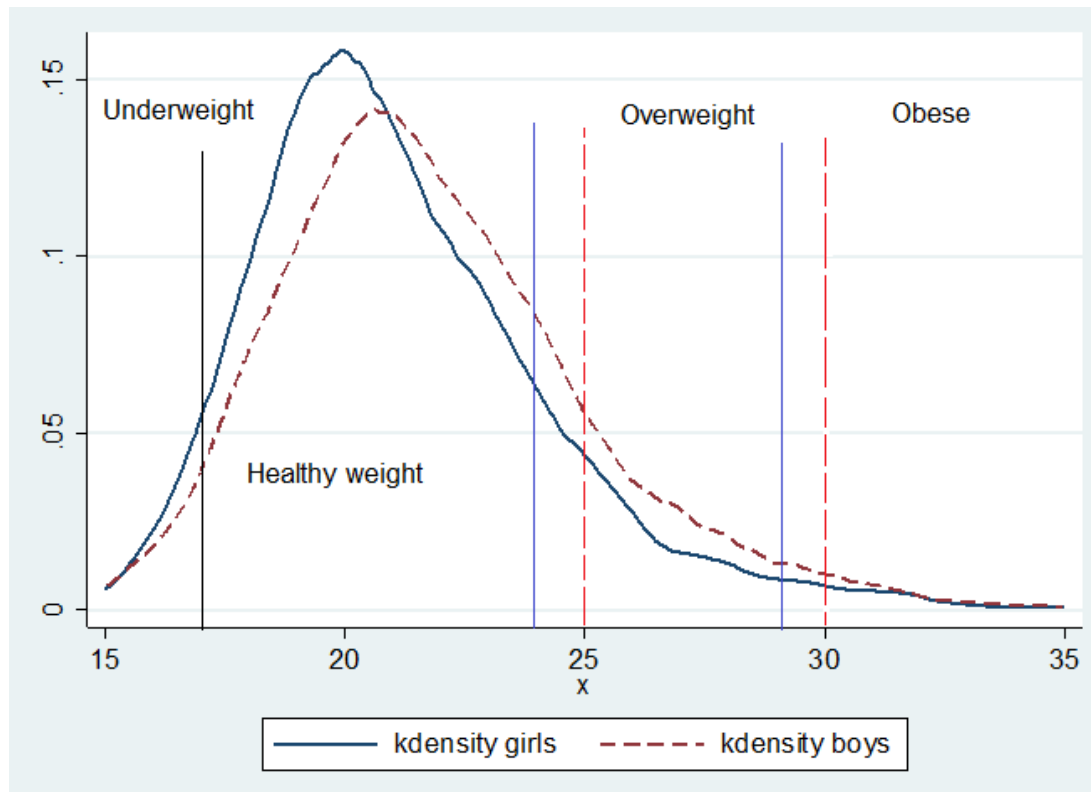
Density of the BMI in our sample (age 16-18)