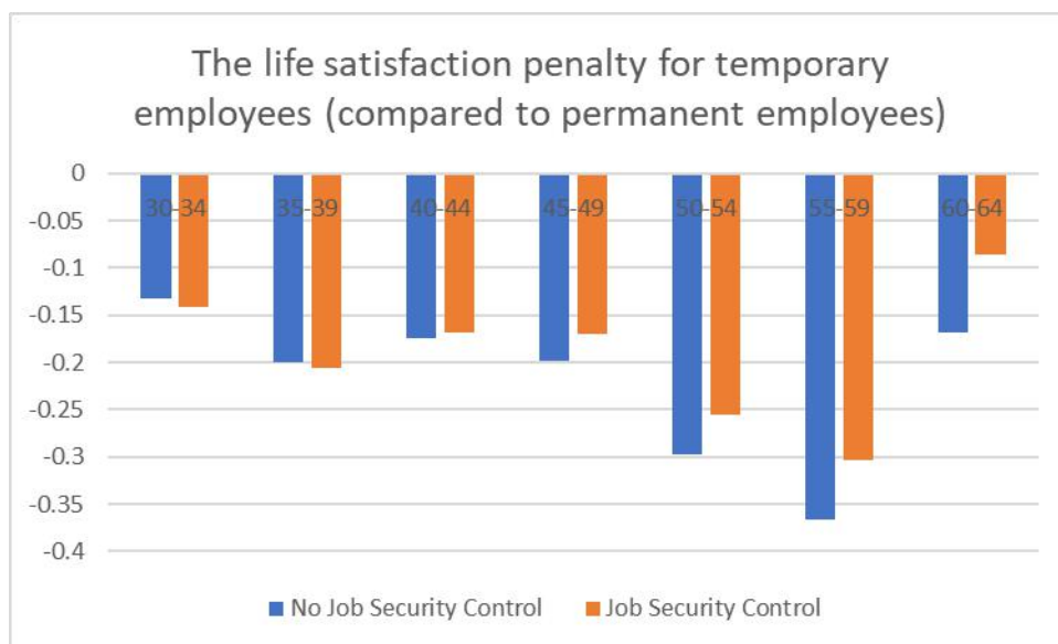
Figure 3: the dip in life satisfaction for temporary employees with and without considering worries about job security.

In columns one and three of table 5 the coefficients of the interaction terms for those in their fifties are less negative than those previously obtained (column 4 of table 3), whereas those in column 2 are similar. This means that job security is responsible for part (about a sixth) of the deepening of the U-shape for midlife temps, and that employment security plays no role. The bar chart just below, figure 3, highlights the differences between estimates with and without the job security control.