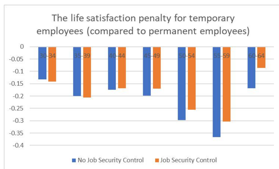
Figure 3: the dip in life satisfaction for temporary employees with and without considering worries about job security.

In columns one and three of table 5 the coefficients of the interaction terms for those in their fifties are less negative than those previously obtained (column 4 of table 3), whereas those in column 2 are similar. This means that job security is responsible for part (about a sixth) of the deepening of the U-shape for midlife temps, and that employment security plays no role. The bar chart just below, figure 3, highlights the differences between estimates with and without the job security control.