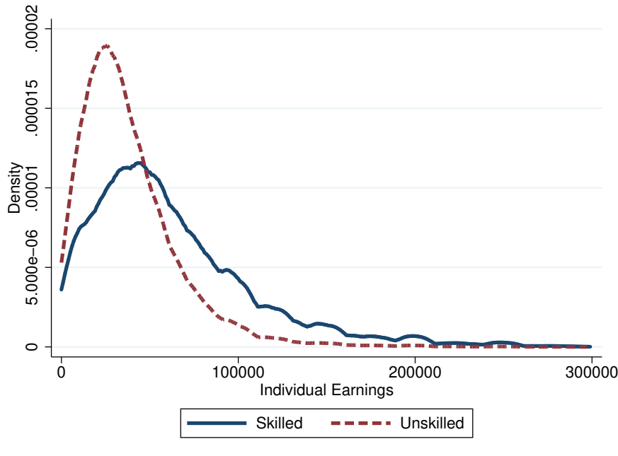
Figure 1: Kernel density plot of individual earnings for low-skilled and high-skilled individuals in our sample conditional on having positive earnings. We truncate the graph at income of $300,000. We define low-skilled individuals as those without any college experience and define high-skilled individuals as workers with at least some college experience.

Figure 1 shows the density of individual earnings for high-skilled and low-skilled workers given our baseline definition of skills. Overall, low-skilled individuals have average earnings of $35,600 while high-skilled individuals have average earnings of $65,800.