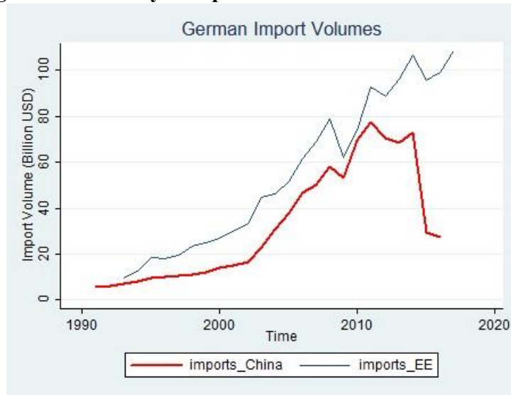
Figure 1: Germany's Imports from China and Eastern Europe