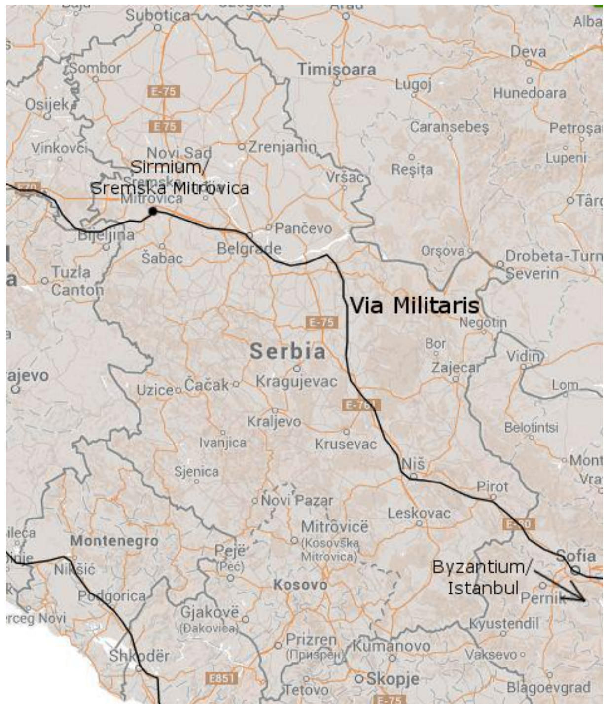
Map 3: Present and ancient Roman roads in Serbia and Montenegro