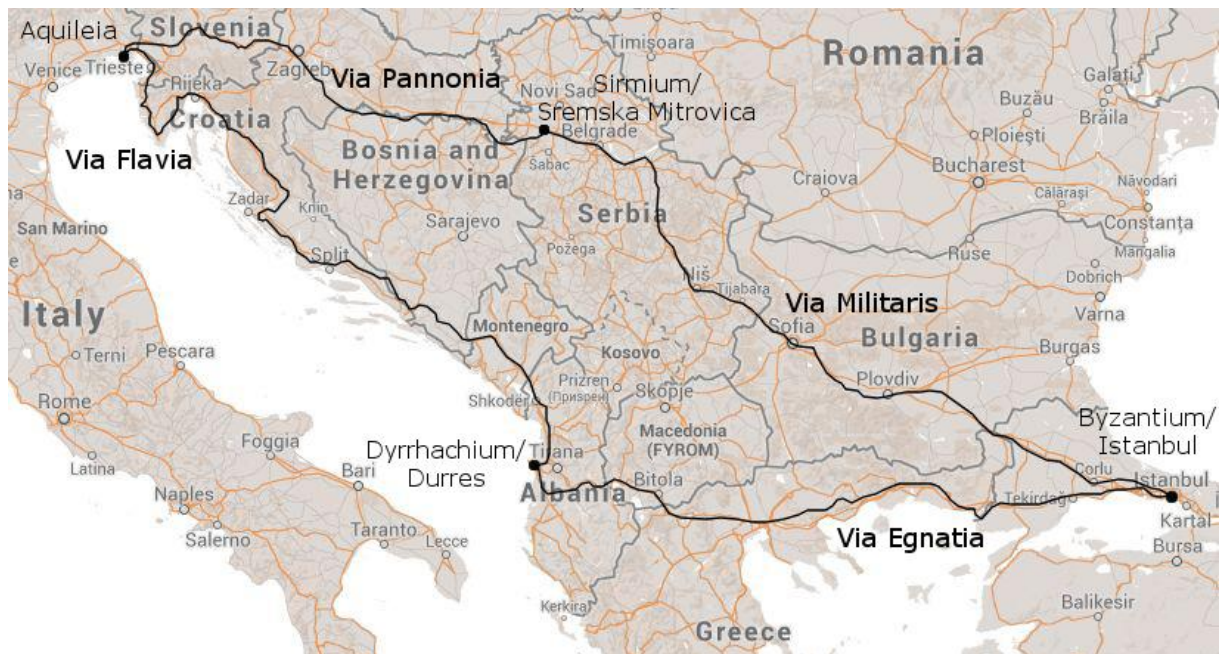
Map 1: Present and ancient Roman roads in the Balkans