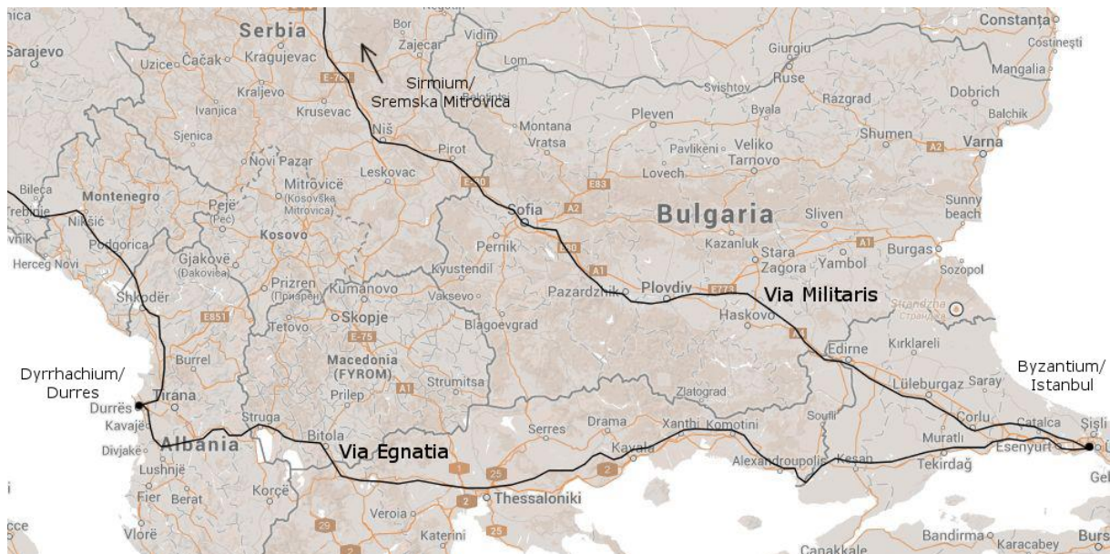
Map 2: Present and ancient Roman roads in Bulgaria, Turkey, Greece, Macedonia and Albania