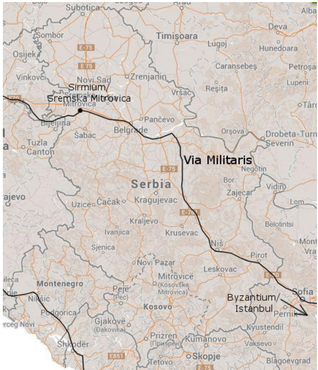
Map 3: Present and ancient Roman roads in Serbia and Montenegro