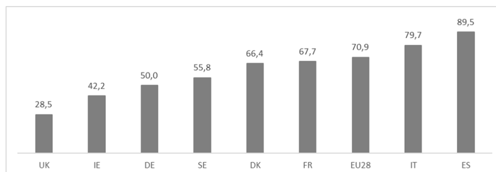
Figure 2.2 Public pension scheme, net replacement rates, 2014 (%)

Notes: net replacement rate is defined as the individual net pension entitlement divided by net pre-retirement earnings, taking account of personal income taxes and social security contributions paid by workers and pensioners (OECD 2015).