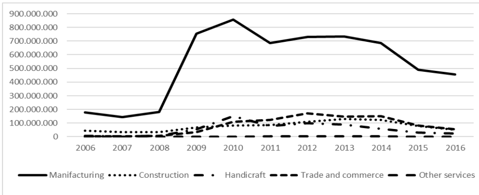
Figure 2.1 Number of authorized hours of CIG (CIGO+CIGS+CIGD), 2006-16