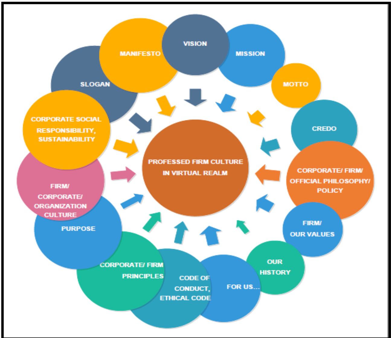
Figure 1. The array of professed firm culture elements, identified in the aforementioned scientific project

time, but all these are accessible on the surveyed companies (sub-)sites that were identified during the probatory empirical research of a small sample of business organizations from diverse economic sectors, i.e. firm's history, general company related information semantically grouped under the summarizing label of "For us...", an official code of conduct or ethical code, "a should-be carefully selected bunch" of important characteristics, outlining the official organization culture, intentional disclosure of company initiatives in the sphere of corporate social responsibility and sustainability orientation in the performed business activities.