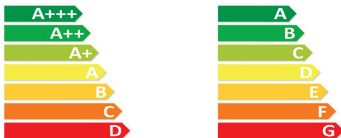
Table 1: Levels of different attributes considered in the refrigerator choice experiment