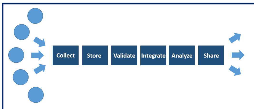
Figure 2. Data management process in IoT data platform

The Smart Campus introduced here has set up an extraordinary open environment, where external stakeholders like enterprises, application and service developers and smart city innovators can join to develop, test and pilot unforeseen products and solutions together with researchers [20]. The framework has gained wide popularity, which has resulted to high amounts of collected data. Typically data is sent through wireless interface, which is part of the IoT infrastructure configuration. Large amounts of data need secure storing before processing, which includes validation to detect corrupted data and conversion to transform data in specified standardized format. In following phases data is integrated together and shared for the use of applications [21]. Through the entire process data security is ensured. The overall data management process is depicted in figure 2.