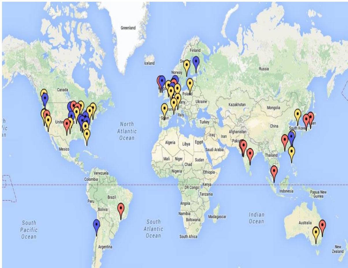
Figure 2: Cloud computing data centers (Amazon: Yellow, Google: blue, Microsoft: red)

make location decisions according to electricity costs, sales tax and other subsidies (Burrington 2015a, Burrington 2015b). Figure 3 shows a map of the cloud computing data centers by three leading firms in the industry: Amazon Web services, Microsoft Azure, and Google. As can be seen, the infrastructure is concentrated in limited locations in mostly developed countries in the United States, Europe, Australia and Asia to serve those markets.