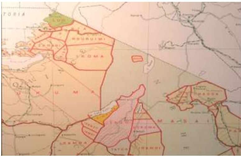
Figure 1: Gorowa Native Authority, "Tribal and Ethnographic Map," Atlas of Tanganyika , 1956

There is nothing informal about the institutions that carve national space into political and administrative sub-divisions in African countries. They are as formal as the départements of France, or state borders in the United States. These jurisdictions are not exactly the same as their counterparts in the countries just mentioned, however. The rules define and divide the political collectivities that rulers are willing to recognize, impose indigene-stranger hierarchy within them, as well as hierarchies among them (ranking agricultural ethnic groups above pastoralists, for example). (See Mamdani, Define and Rule ). These same rules restrain labor and class mobility in agrarian society, the functioning of markets, and national integration.