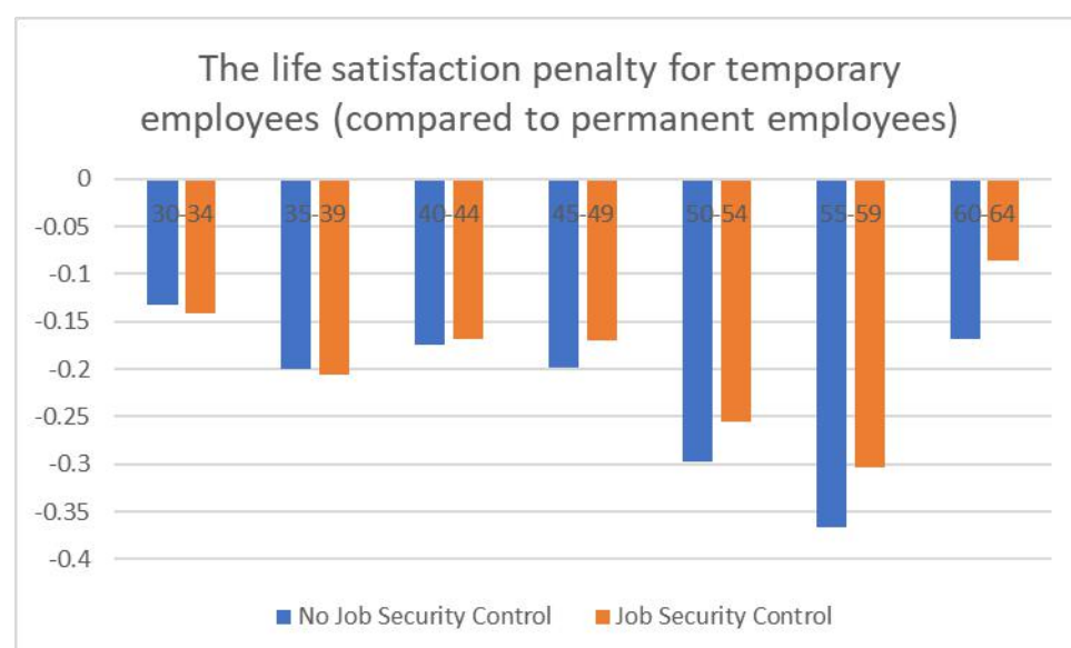
Figure 3: the dip in life satisfaction for temporary employees with and without considering worries about job security.

In columns one and three of table 5 the coefficients of the interaction terms for those in their fifties are less negative than those previously obtained (column 4 of table 3), whereas those in column 2 are similar. This means that job security is responsible for part (about a sixth) of the deepening of the U-shape for midlife temps, and that employment security plays no role. The bar chart just below, figure 3, highlights the differences between estimates with and without the job security control.