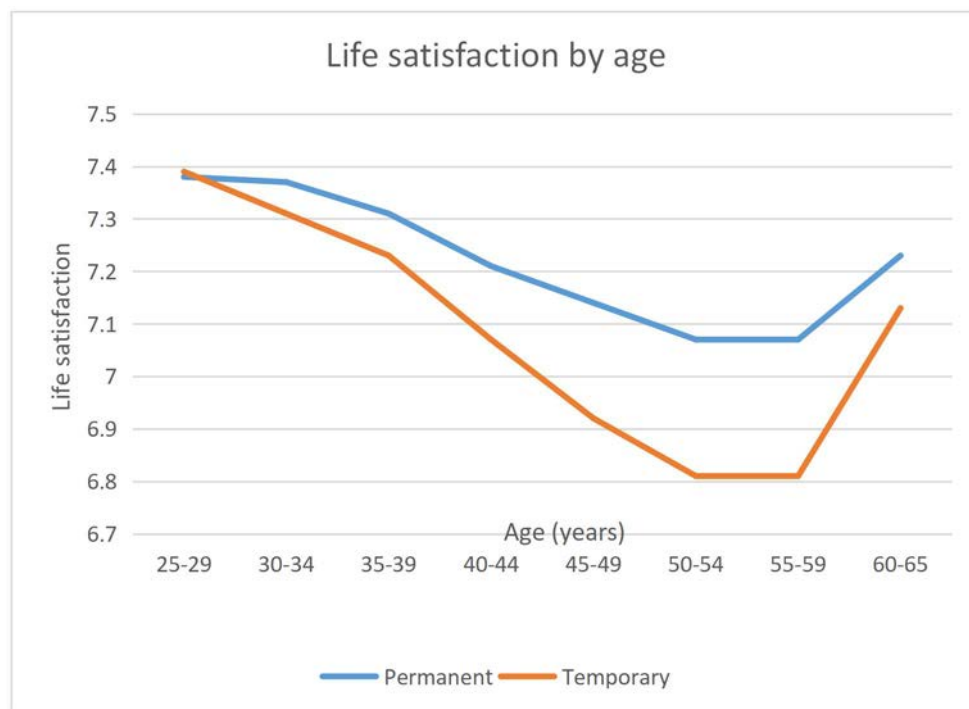
Figure 2: Average Life Satisfaction Against Age in Permanent and Temporary employees, SOEP data 1995-2017

SOEP data used: Socio-Economic Panel (SOEP), data for years 1995-2017, version 34, SOEP, 2017, doi: 10.5684/soepv34.